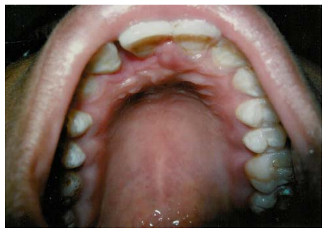
Post-operative Photograph after 1 year